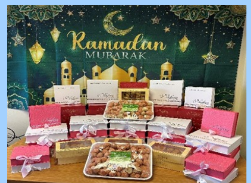
Image: some of the food in our services to celebrate Eid-al-Fitr

We recognise and embrace diversity, and continue to celebrate significant festivals from different cultures and faiths. We have recently celebrated Eid-al-Fitr across the service which was really well received by all of our service users. There was also a special menu developed by our catering department to support the event.