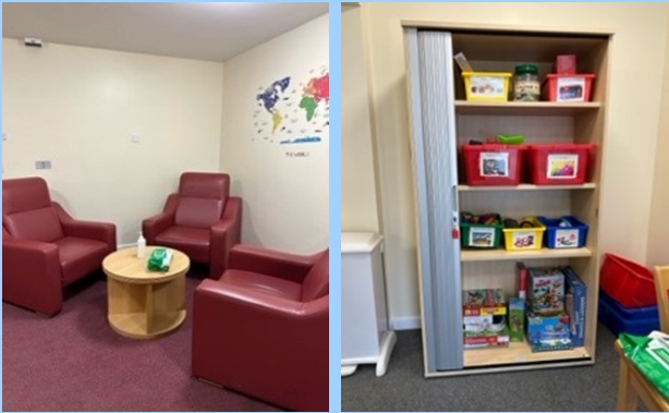
Images: our improved visitor areas

We hope you have seen the improvements to our visitor areas. We have new furniture, toys, and extra resources. We hope you find our visitor areas more comfortable, pleasant and welcoming. Please let us know if you have any ideas for further improvements to our visitor areas.